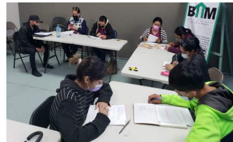
Teachers assistants to the preparatory course for adult school (INEA).

Because of its importance, this program, despite the pandemic, was able to continue remotely, with counseling to adults who were interested in receiving their diploma.