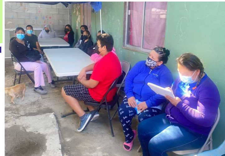
Community members from Tlatelolco are being informed of the program.