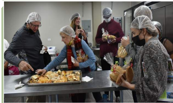
Bakery students having a tasting with Locke Family.

On February 8, we started with in person classes with small groups of children taking four classes from 2-4:30 PM daily. Before the arrival of any student, the center is sanitized, their temperature is taken, social distancing is in place, and the use of face masks is required.