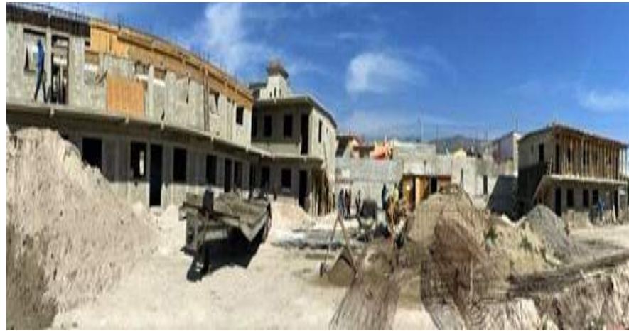
Construction of one of the units in Villa Margarita

The project of Villa Margarita is advancing and with it, the families who qualified. Even without having land, soon they will have the peace of mind of having a home with the basic necessities that will allow them to coexist as a family in a community of respect and harmony.