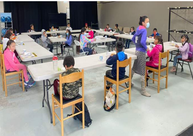
Kids of the community receive meals maintaining social distancing.

With the resumption of in-person classes, also the kitchen services were initiated where food is prepared with strict hygiene measures and food balance, which benefits the student population of the CC community, that way they can improve their learning and have good health.