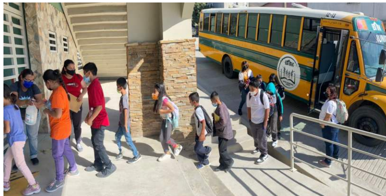
Young children from neighboring communities enter the Community Center Thanks to the generosity of the sponsors, "Junior" and "Susana" provide great support to the educational goals of the center

The transportation of minors makes it easier for them to arrive safely at educational support classes. "Junior" and "Susana", the CC's two buses, pick up the children and young people in the agree upon meeting points, outside their school scheduled hours.