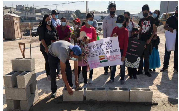
Laying of the first stone in Villa Margarita

The project of Villa Margarita is advancing and with it, the families who qualified. Even without having land, soon they will have the peace of mind of having a home with the basic necessities that will allow them to coexist as a family in a community of respect and harmony.