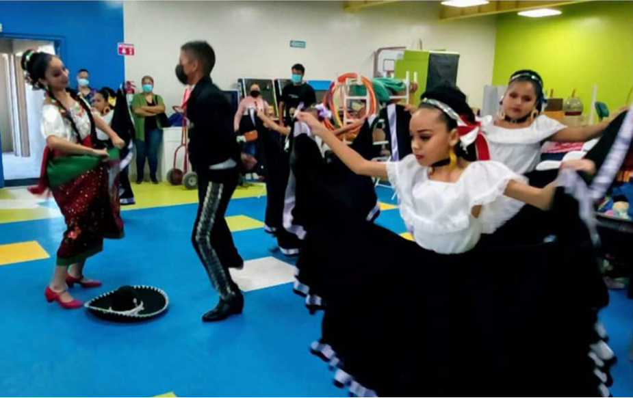
Alumnas aprendiendo el faldeo y los niños la postura básica del charro en la clase de danza folklórica