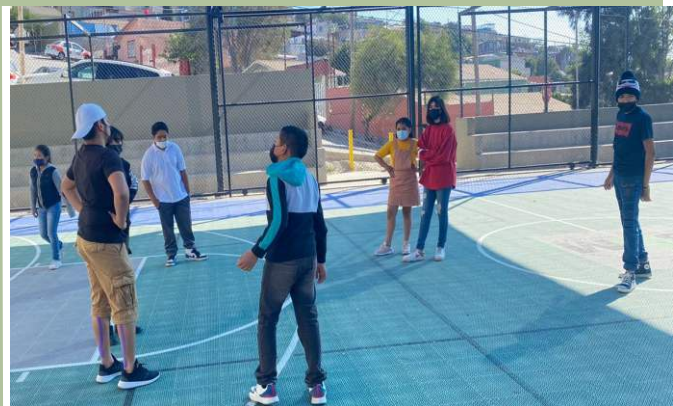
Niños y jóvenes ocupan canchas practicando la activación física